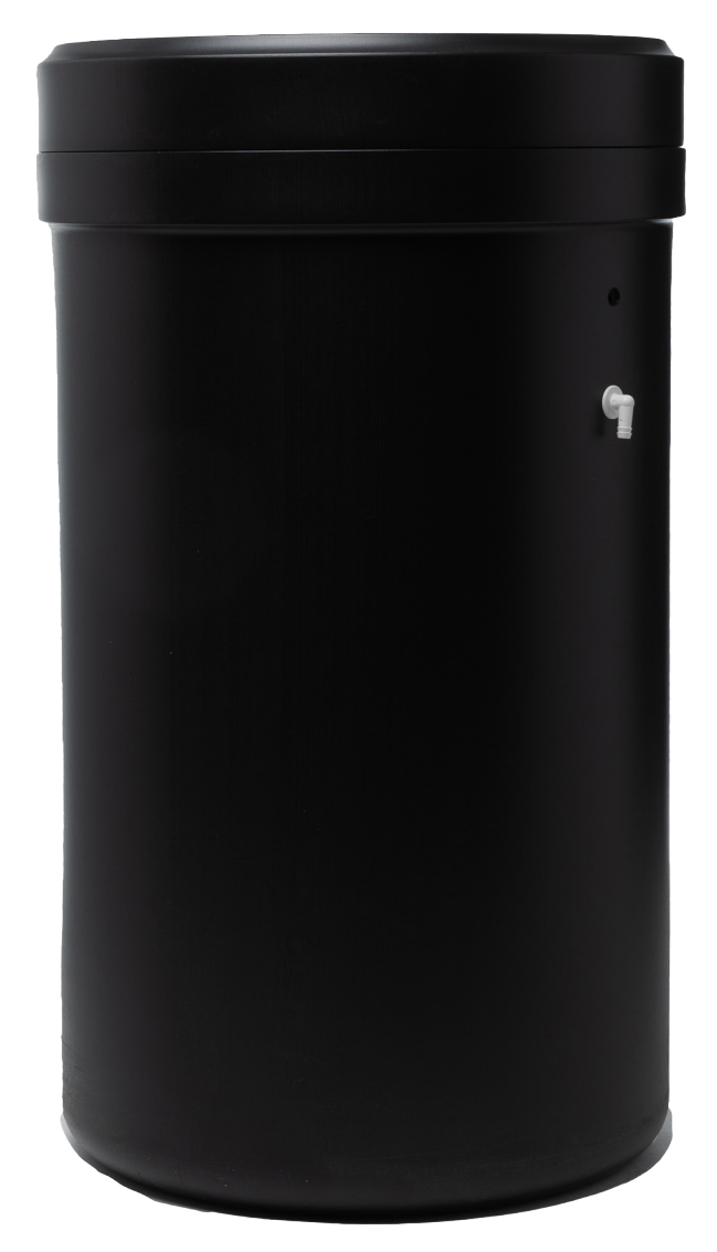
\label{thm:product} \textit{Due to continuous product improvements, image may differ slightly from actual product.}